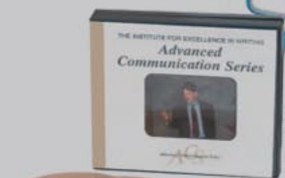
Institute for Excellence in Writing 800-856-5815