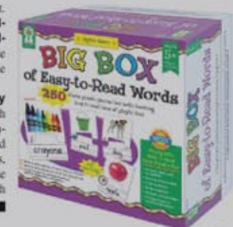
Key Education (distributed by Carson-Dellosa) 800-321-0943