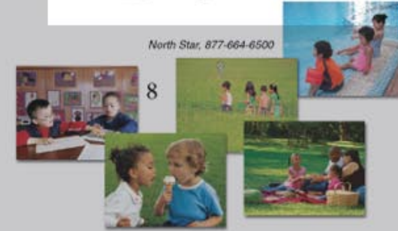
North Star, 877-664-6500