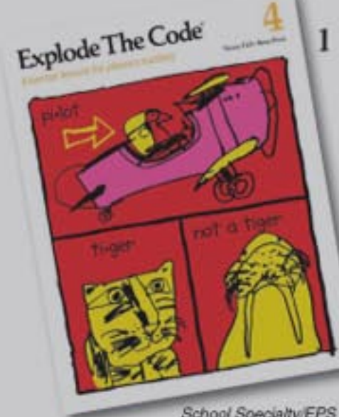
School Specialty/EPS 800-225-5750